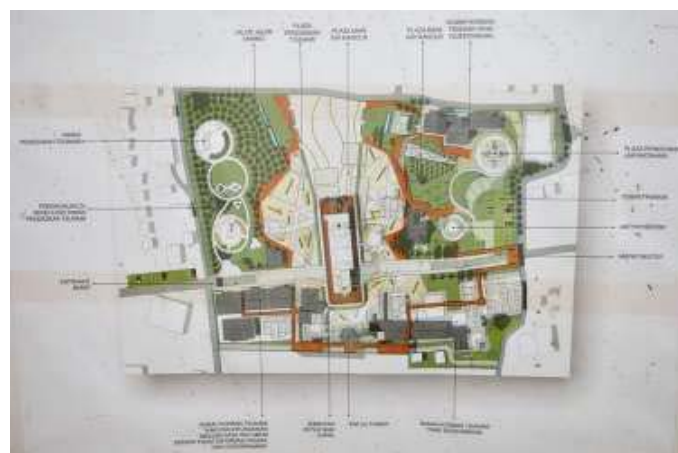
Figure 3. Site Plan Tsunami Tourism site, PLTD Apung Ship

Diesel Power Plant (PLTD) Ship is a ship owned by Electricity Company (PLN), which is currently used as a tourist and known as "Kapal Apung Tour" (Figure 3). According to data from the guide, the ship has a length of 63 meters, 19 meters wide and 4.3 meters high that capable of generating 10.5 megawatts of electricity with an area of about 1900 m 2 and weighing 2,600 tons. Ownership of this shipbuilding assets belongs to Geology Museum of Bandung, under the Ministry of Resources and Minerals, while the ownership of land assets by the Municipal Government of Banda Aceh, where all activities on the ship PLTD Apung Ship under the supervision of the Department of Culture and Tourism. The development of this site was carried out on an area of 25,000 m 2 starting planning drawings in 2008 (Figure 3) and continued with physical and environmental arrangements under the supervision of earth experts, art and culture experts.