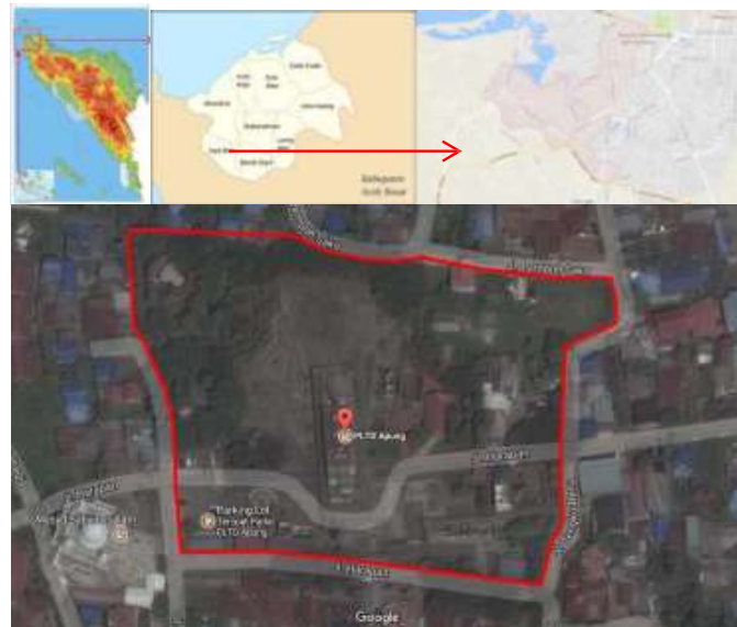
Figure 2. Location of PLTD Apung site, Punge Blang Cut

Diesel Power Plant (PLTD) Ship is a ship owned by Electricity Company (PLN), which is currently used as a tourist and known as "Kapal Apung Tour" (Figure 3). According to data from the guide, the ship has a length of 63 meters, 19 meters wide and 4.3 meters high that capable of generating 10.5 megawatts of electricity with an area of about 1900 m 2 and weighing 2,600 tons. Ownership of this shipbuilding assets belongs to Geology Museum of Bandung, under the Ministry of Resources and Minerals, while the ownership of land assets by the Municipal Government of Banda Aceh, where all activities on the ship PLTD Apung Ship under the supervision of the Department of Culture and Tourism. The development of this site was carried out on an area of 25,000 m 2 starting planning drawings in 2008 (Figure 3) and continued with physical and environmental arrangements under the supervision of earth experts, art and culture experts.