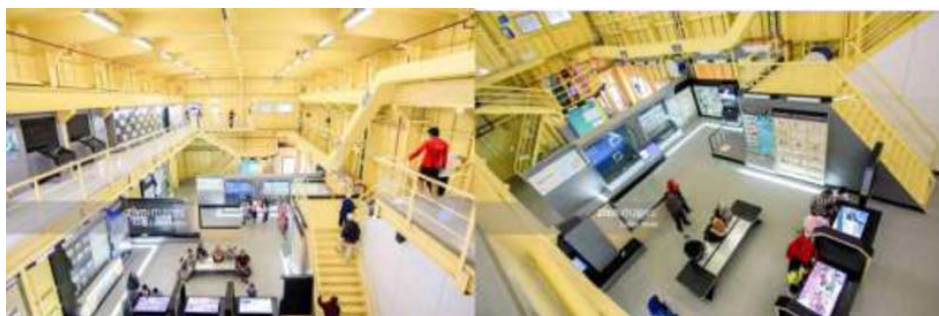
Figure 4. The granary of PLTD Apung as Demonstration Room.